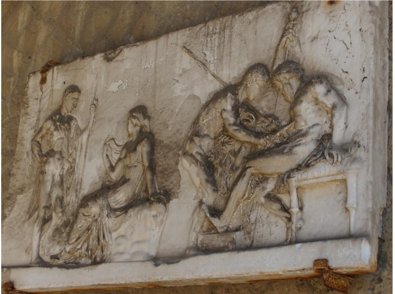
Figure 1 – Odysseus scraping rust from Achilles’ spear into the wound of Telephos – relief in Herculaneum.

This myth is reported by Euripides, but has survived only in fragments [15]. Before the Greeks reached Troy, they landed too far south, in the land of the Mysians, and got into a scuffle with them in which Telephos, the king of the Mysians, was injured. The Greeks moved on, the wound festering. When Telephos was at a loss, he did what all Greeks did when they were desperate: He sent to the Delphic Oracle. The oracle told him: “Ho trosas kai iasetai – the one who struck the wound will heal it.” The riddle was solved by Odysseus. He took the spear of Achilles, who had struck the wound, scraped its rust into Telephos’ wound, which then healed. This myth was widespread in ancient times, as attested by the relief found in Herculaneum (Fig. 1; there is a similar image on the Pergamon Altar in the Berlin Museum, if I remember correctly).