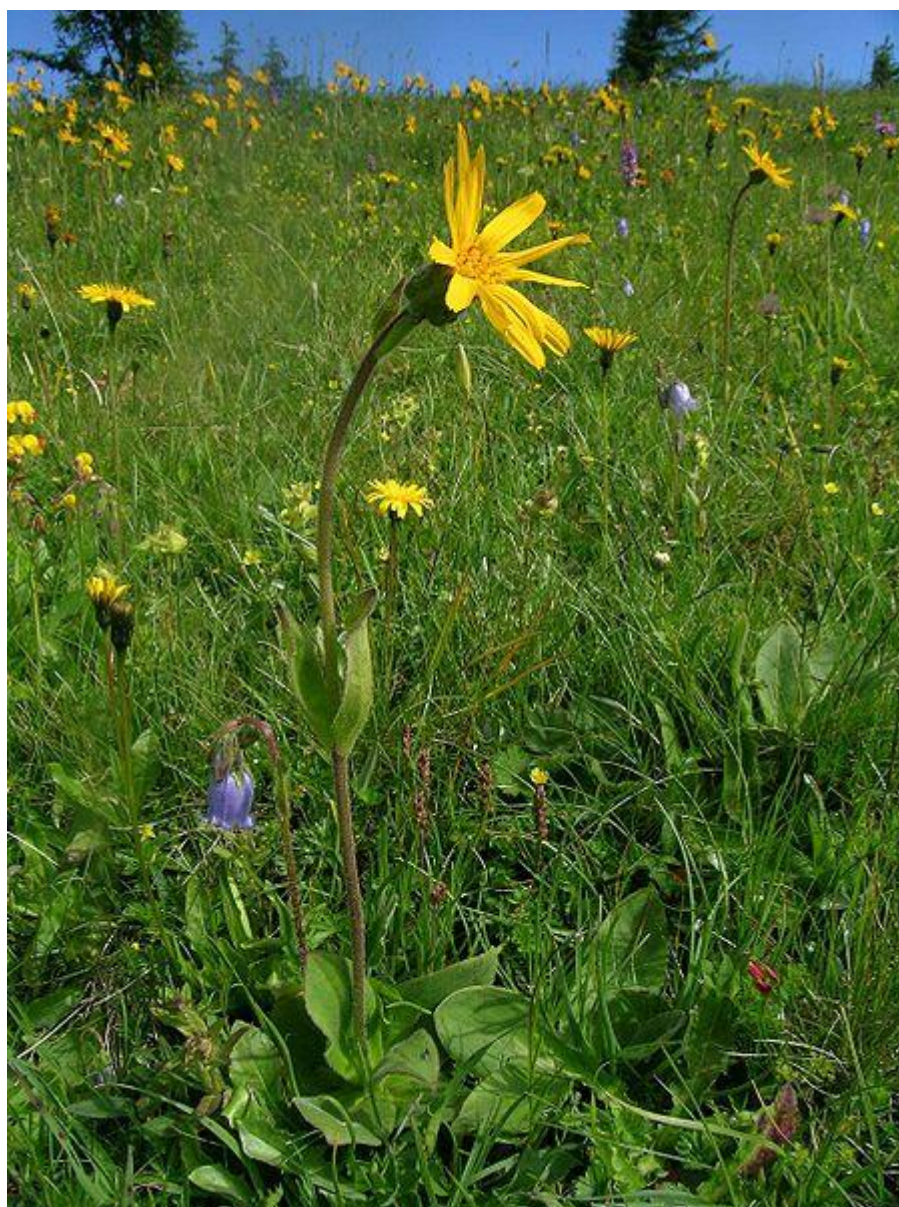
Figure 2 – Arnica montana

Arnica is an ancient medicinal plant. It is also called the “fall weed” or the “mountain weed”. It is often found as an extract in old tinctures for rubbing into aches and pains, although external application is not usually favourable because it can cause skin irritation. Arnica grows in the mountains, at altitudes between 800 and 1400 m approximately, depending on the climate. I have often seen it there on mountain hikes, but not at lower altitudes.